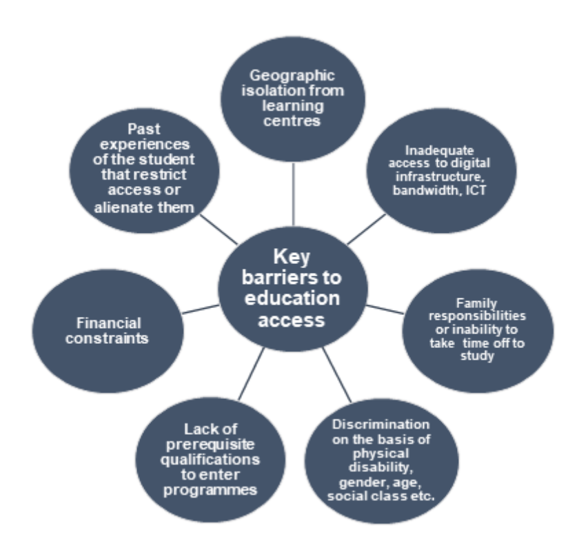
Figure 1: Barriers to access in South Africa's higher education sector

Specific barriers that Post School Education and Training in South Africa seeks to address are summarised in Figure 1.